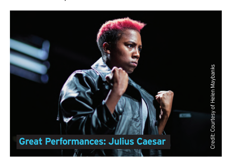
KPBS 2 Great Performances Julius Caesar: Experience Shakespeare in an all-female production from the Donamr Warehouse set in prison

9:00 KPBS Doc Martin Listen with Mother: Martin reluctantly agrees to help Louisa hand out awards at her school's sports day.